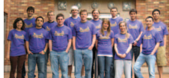
Members of the Steel Bridge team outside More Hall.

The Steel Bridge team of 15–20 undergraduates built a 21' × 4.5' bridge that weighed approximately 150 lbs.