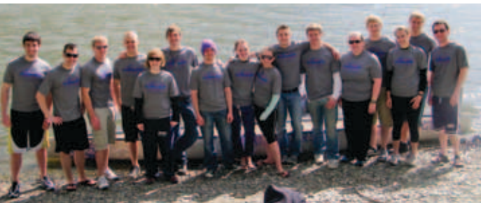
The Dawgs Are #1! Members of the canoe team on the banks of the Snake River in Pullman.

For more competition results, visit the 2010 ASCE Pacific Northwest Regional Conference website at http://asce.ce.wsu.edu/pnwrc2010/canoe.html .