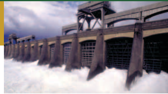
Bonneville Dam spillway structure.

The CEE team created a computer program that compared historical conditions with a scenario where temperatures are 2 degrees Celsius higher on average than today, a change expected in the Pacific Northwest by the second half of the century. The simulations