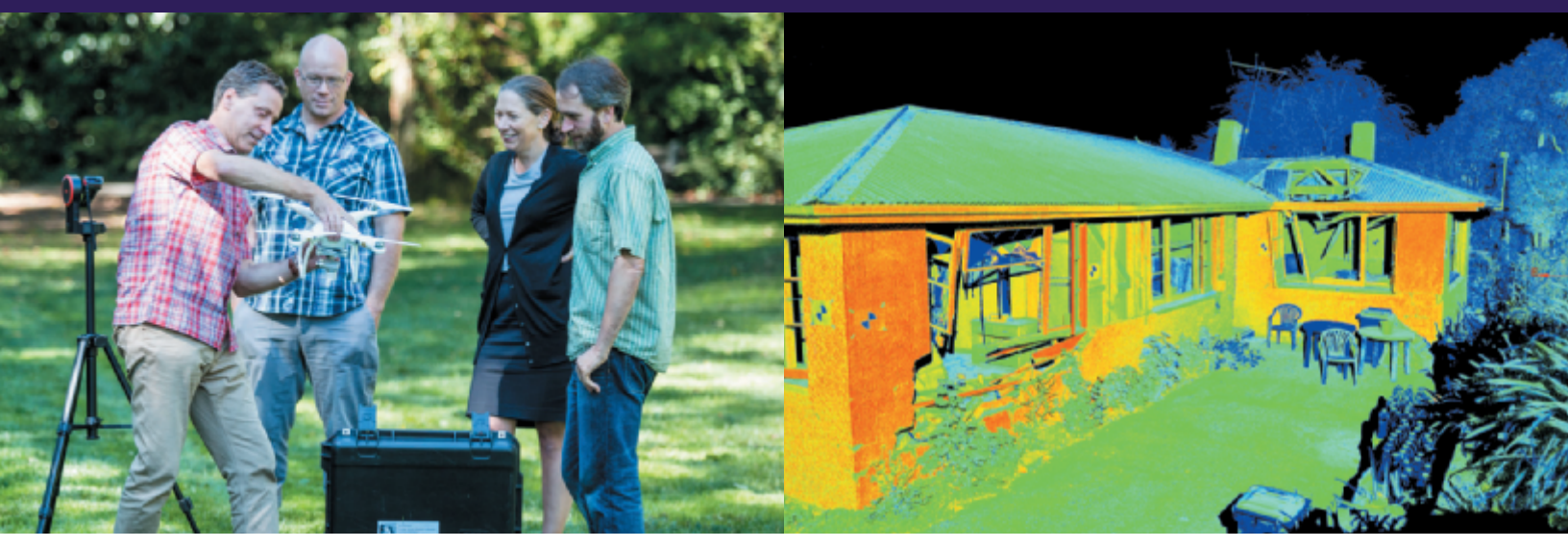
Above left: The UW faculty team tests an Unmanned Ariel System, or drone, that will be used for aerial reconnaissance. Above right: The new center will use state-of-the-art laser equipment to provide detailed scans such as this one, which shows a home damaged by rockfall during the 2011 Christchurch earthquake. The ultra-high resolution helps investigators better understand factors that enhance the resiliency of homes.

stored and shared as open-source data with the broader research community.