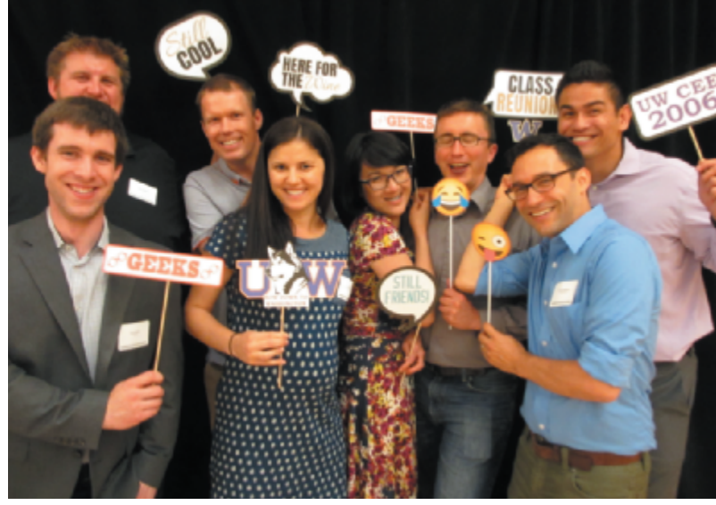
CEE alumni have fun making new memories in a photo booth.

"I wish more CEE classes did something like this. It