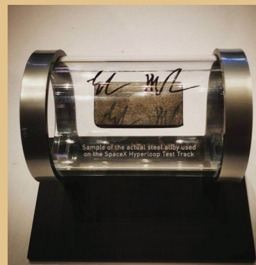
The UW team's trophy, signed by Elon Musk.

The new ground transportation idea was originally unveiled in 2013 by entrepreneur Elon Musk, the founder of SpaceX and co-founder of Tesla Motors. Musk came up with the concept after being frustrated with California's high-speed rail project, saying that the Hyperloop system could make transportation more efficient between cities, such as traveling between Los Angeles and San Francisco in 30 minutes.